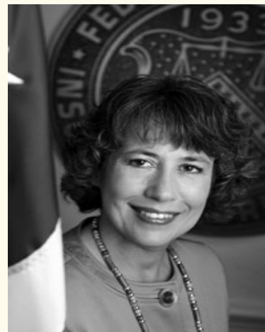
Chairman Sheila C. Bair Federal Deposit Insurance Corporation

I have long supported a systematic and streamlined approach to loan modifications that puts borrowers into affordable, long-term mortgages while achieving an improved return for bankers and investors compared to foreclosure. Using this type of approach, we can help stabilize the U.S. financial markets by minimizing foreclosures on the 6.4 million loans that are currently past due or are projected to become delinquent by mid-2010. Avoiding foreclosure, when it is financially prudent to do so, reduces the downward pressure on the price of nearby homes and helps communities to maintain the services they provide to neighborhoods. Unnecessary foreclosures perpetuate the cycle of financial distress and risk aversion, which potentially could cause housing prices to overcorrect and create even larger losses for both borrowers and the financial industry.